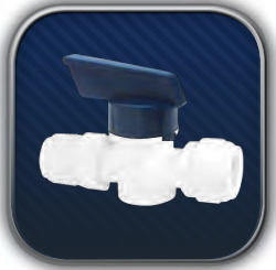
Male Ball Valve