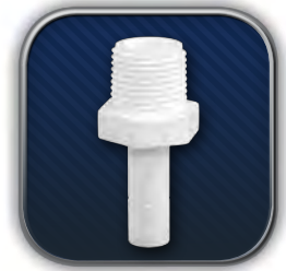
Male Stem Adapter