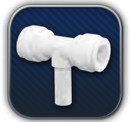
Stem Branch Tee