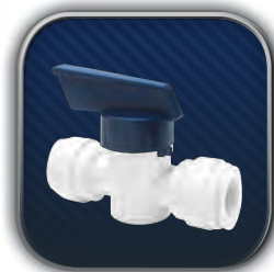
Inline Ball Valve