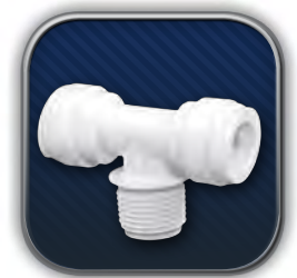
Male Branch Tee