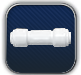
Inline Check Valve