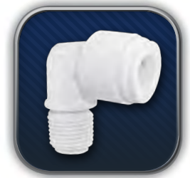
Elbow Check Valve