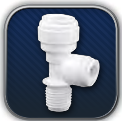
Male Run Tee