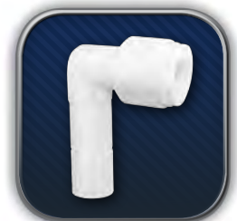
Plug In Elbow