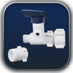
Angle Stop Valve Adaptor