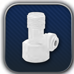
Feed Water Adaptor