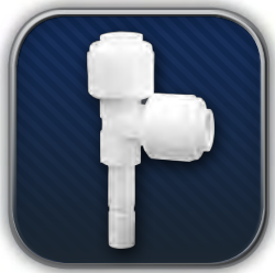
Stem Run Tee