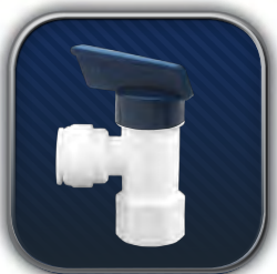
Tank Ball Valve